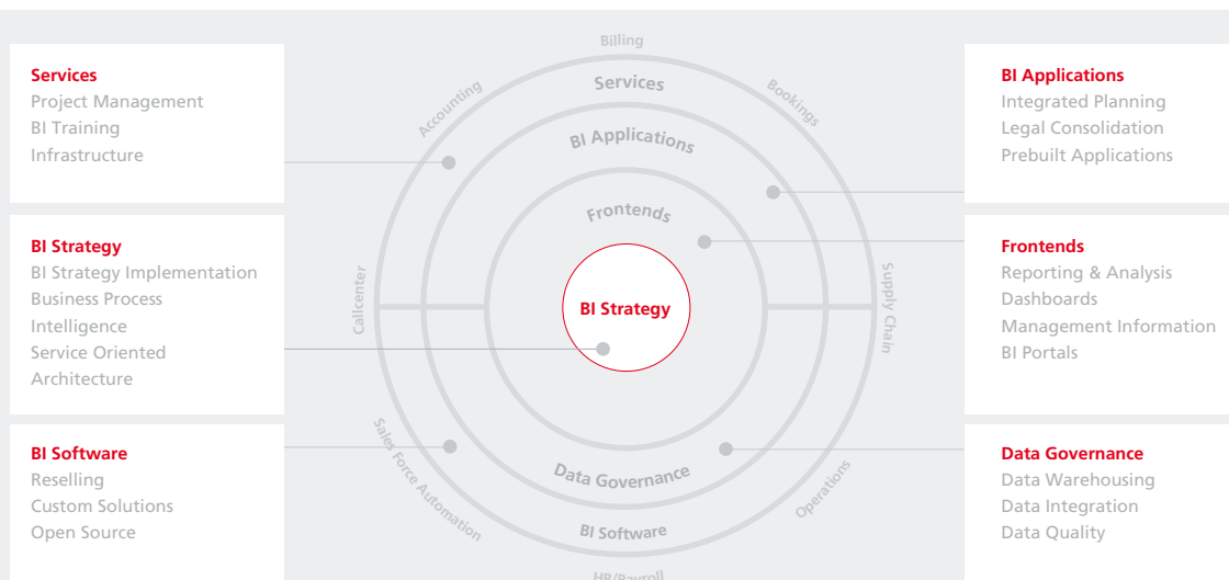
Range of services provided by the new BI Technology service line

BI is becoming omnipresent. Previously, only selected staff in controlling and accounting departments employed the corresponding reporting and analytical tools. In future, these tools will not only be called into play by authorised decision-makers, but also by operatively active personnel in sales, marketing and production departments.